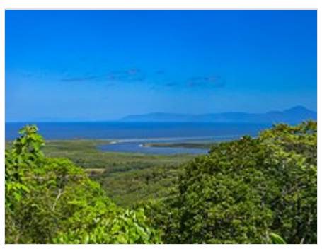
View from <u>Daintree National Park</u>, 2009

Various government departments and agencies have different definitions for the region. The Queensland Government department of Trade and Investment Queensland defines the region as an area comprising the