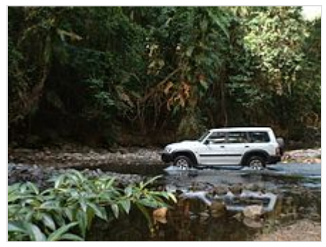
Bloomfield Track in the Daintree Rainforest

The region supports a large tourism industry and is considered a premier tourist destination in Australia.<sup>[6]</sup> Nearly one third of international visitors to the state come to the region.<sup>[6]</sup> Attractions include the <u>Great Barrier Reef</u>, <u>Daintree Rainforest</u> and other <u>Queensland tropical rain forests</u> within the <u>Wet Tropics of Queensland</u> heritage area, the <u>Atherton Tableland</u>, <u>Hinchinbrook Island</u> and other resort islands such as <u>Dunk Island</u> and <u>Green Island</u>. Major attractions around and in Cairns include <u>Cairns Aquarium</u>, <u>Cairns Botanic Gardens</u>, <u>The Reef Hotel Casino</u>, <u>Kuranda Scenic Railway</u>, <u>Barron Falls</u> and the <u>Skyrail Rainforest Cableway</u>. Towns and localities attracting large numbers of tourists include Cape Tribulation, Port Douglas, Mission Beach and