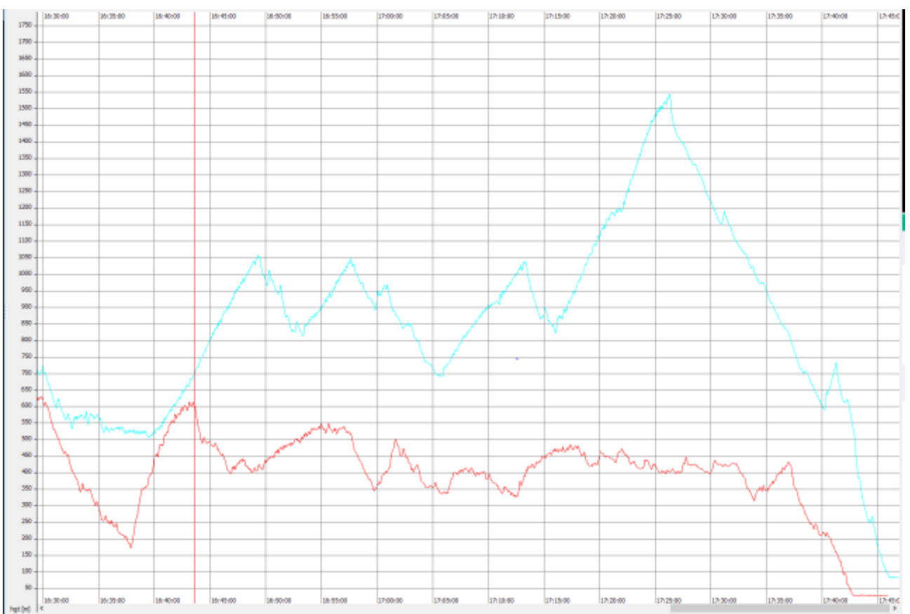
Figure 9: Barogram of GT and VS on task 3 after passing turning point "208Paseimeniai"

To sum up the above-mentioned evidence and after having a closer look into the IGC flight files of both pilots, VS and GT neither exploited same thermals nor flew the same track, always at a considerable altitude difference and